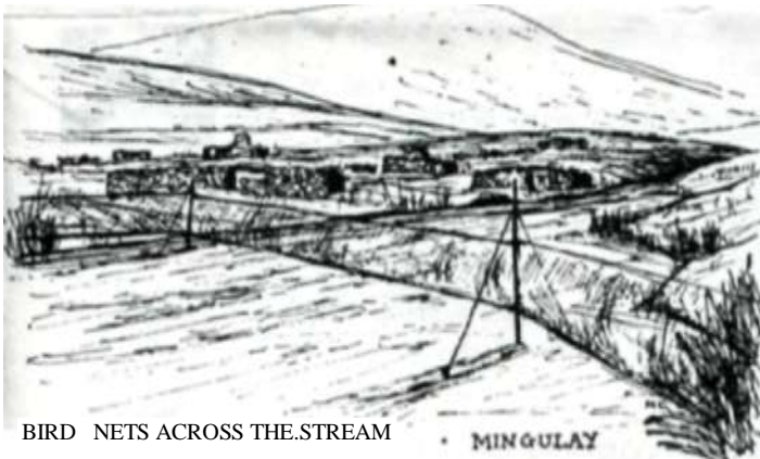
BIRD NETS ACROSS THE STREAM