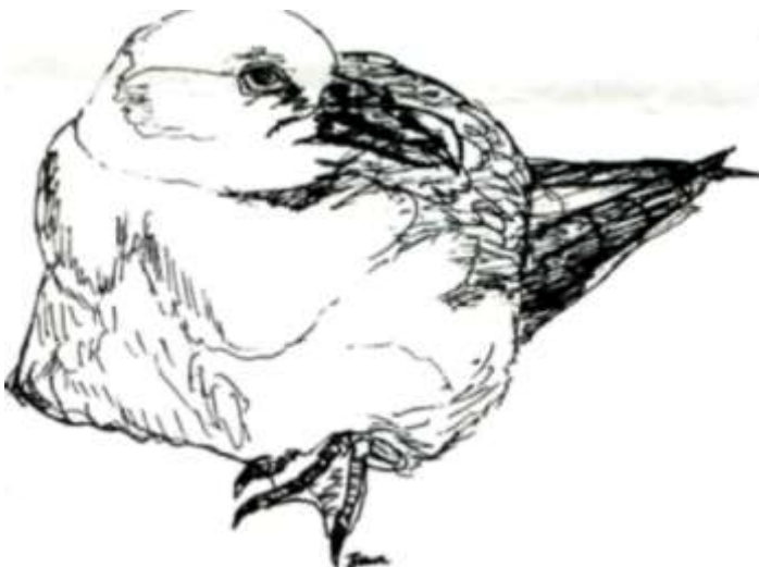
FRED THE FULMAR

Raasay lies between Skye and the mainland, an island twenty miles long by four miles wide. It is geologically one of the most interesting parts of the British Isles, and this geology gives rise to a wide variation of scenery within the island, including it's table top mountain. Dun Caan.